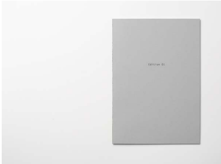
Edition01, 2021 Softcover, 26 pages, limited edition