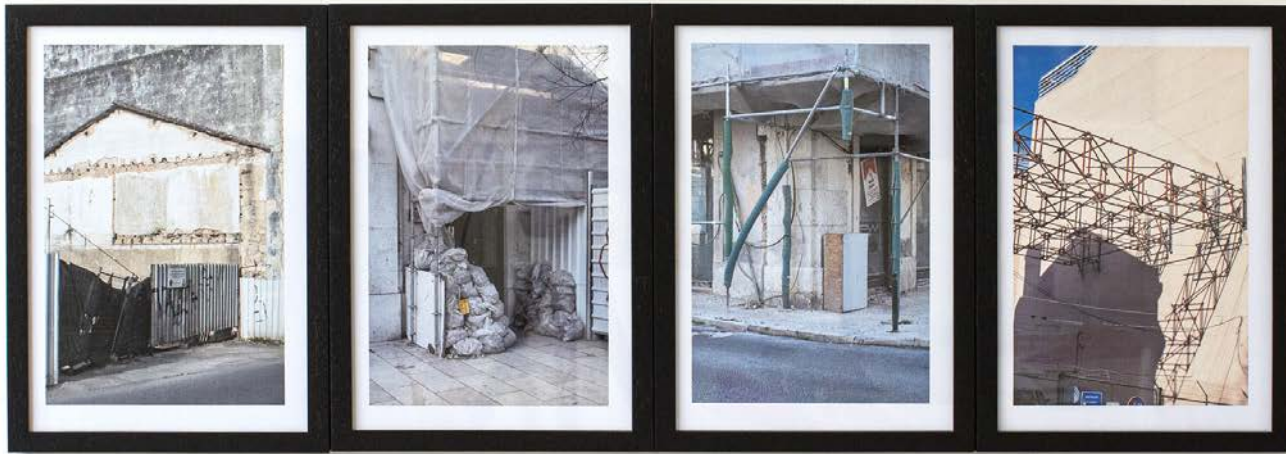
spaces in trouble, 2020 series of 4, 40x30cm, C-Prints

Upgrading housing is a process that has always been part of modern society. But in more and more cases, the demand for livable and affordable housing and the concrete construction projects and conversion measures are diverging. This is particularly visible in urban contexts and even more so in more southern regions. The selling off of real estate to foreign investors and investors is becoming visible in more and more cities and is drastically changing the living space of local urban populations. The work tries to trace these processes and to show how much they take over the visibility of urban spaces.