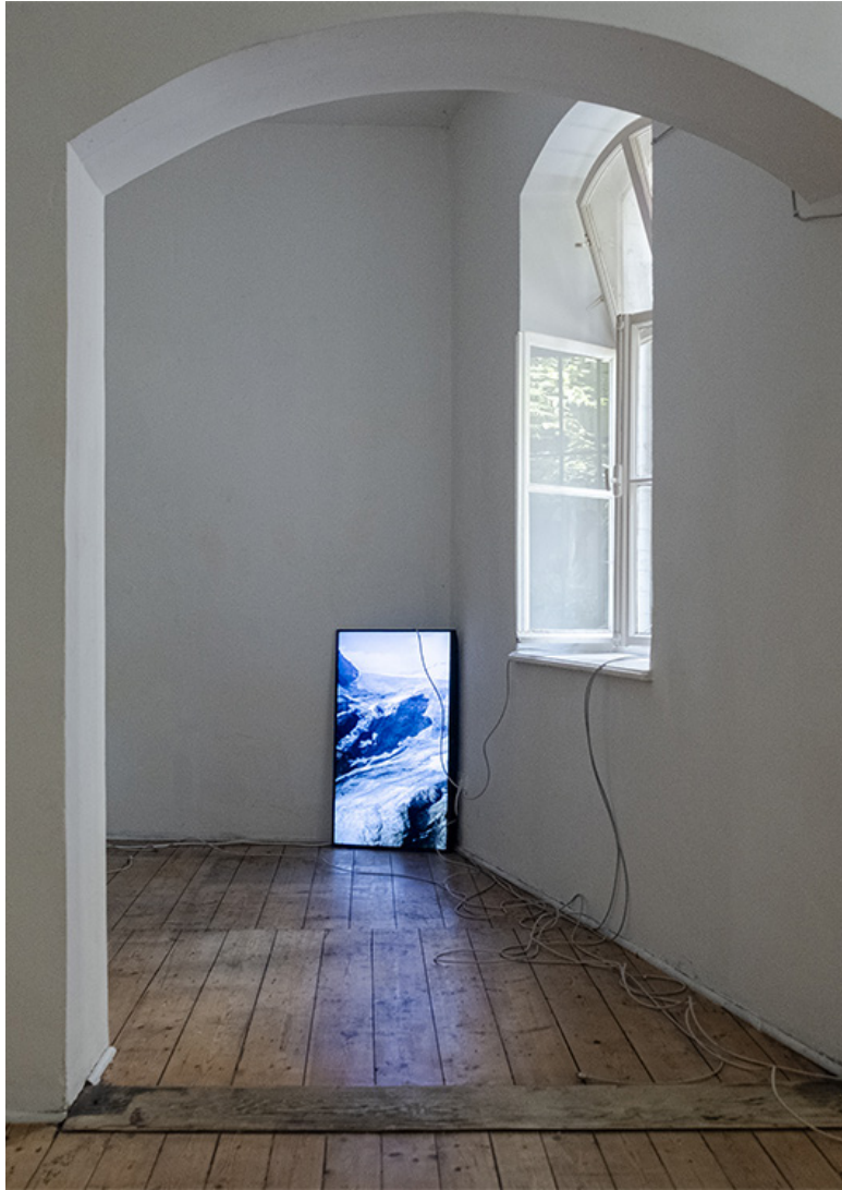
future memories, 2022 Videoinstallation, HD, 1 Minute