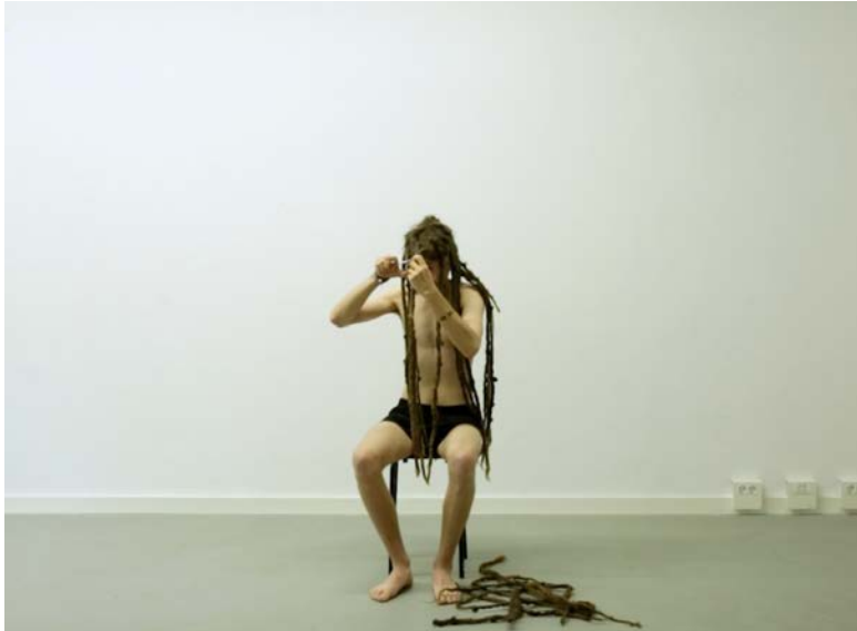
interlaced, 2021 Videoinstallation, PAL SD, 5.25 Minutes