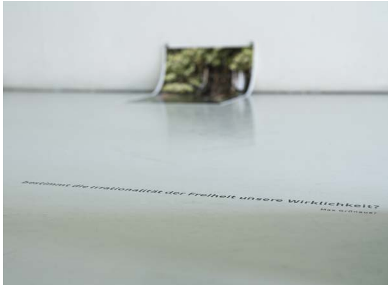
bestimmt die Irrationalität der Freiheit unsere Wirklichkeit?, 2021 Series of 6 and publication, div. sizes, c-prints

Based on the occupation with the system theory of Niklas Luhmann and the concept of culture Andreas Reckwitz the pre-diploma thesis „does the irrationality of freedom determine our reality?“ was created.