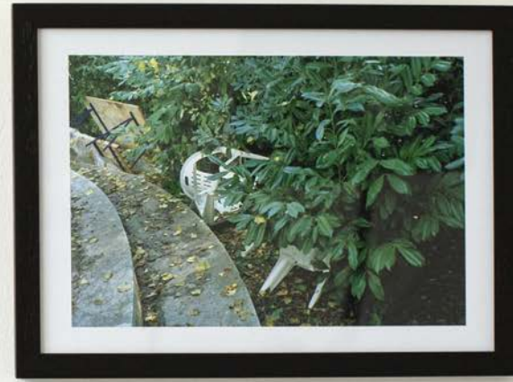
in venice / a brief look, 2019 Dyptichon, 24x16 cm, C-Prints

The photo dyptych is a self-critical wink in the direction of the culture industry. On the Giardini grounds everything gives itself the grand appearance, but if one changes the perspective a little, a different picture is revealed. The Biennale di Venezia can be understood as a moment of parallelisms, whose inner contradiction stands in as a representative of an entire „industry“.